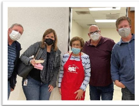
Many thanks to our Crab Feed helpers

There is no way I can ever thank everyone enough for all your hard work. It was more difficult this year. But it turned out great, and we look forward to our next one in 2023. THANK YOU TO EVERYONE WHO HELPED!