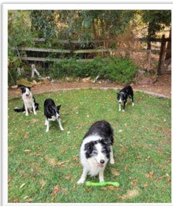
The Paw Patrol, clockwise, starting at bottom center: Tap-16 years old, Hope-8 years old, Sam-7 months old, Brooke-11 years old.