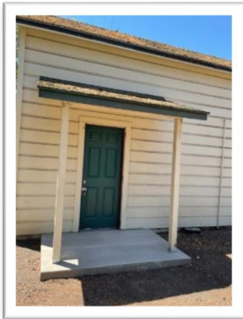
Meat Locker overhang and porch.