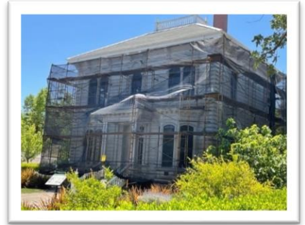
Glass House prepared for exterior maintenance.