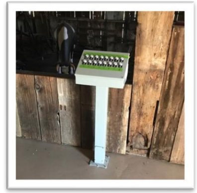
Ole Barn lighting control panel.